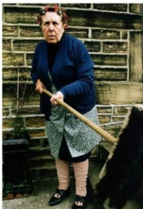
Social Distancing Yorkshire Style